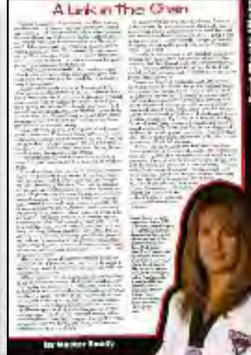
Speaker at industry shows