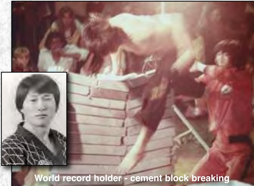
World record holder - cement block breaking