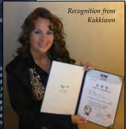
Recognition from Kukkiwon