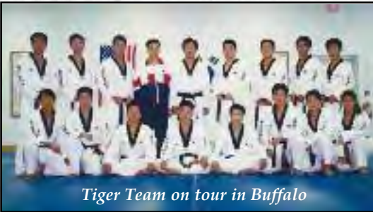
Tiger Team on tour in Buffalo

mountain chain consisting of seven peaks. The last mountain has a steep drop and there are thick ropes permanently attached to rappel down the side. The Tigers use this as a warm-up.